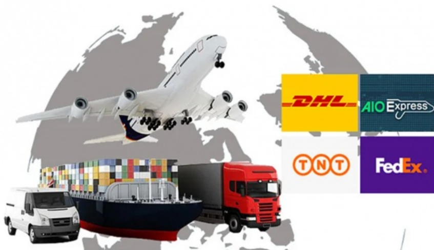
Packing & Delivery